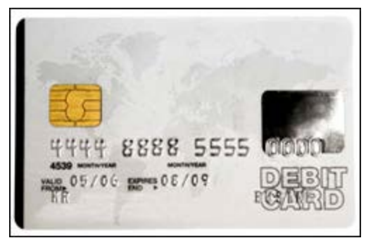
Figure 1. Smart card example.

What is a smart card? A smart card is generally defined as any pocket-sized card containing an embedded integrated circuit. Because of the embedded integrated circuit, smart cards are sometimes referred to as Integrated Circuit Cards, or ICCs. Figure 1 shows a typical example. Used in widely varying applications, these cards replace the familiar payment (debit or credit) cards that use a magnetic stripe to store information about the card account. The transition to smart cards in payment applications is occurring primarily because of increased functionality, and especially because of the improved security possible with this technology. These latter capabilities must, however, be evaluated against the smart card's higher cost.