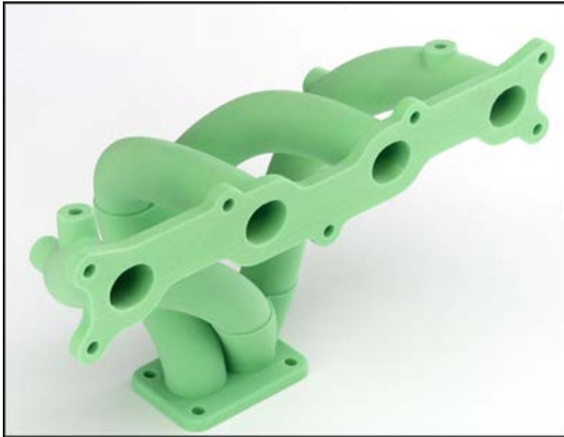
Figure 1. Sample objects created by 3D printing.

The 3D printing technique has been evolving to create 3D models and prototypes in the automotive, aerospace, healthcare, and consumer industries. Aficionados believe that these 3D models could help companies complete a project in less time and/or with fewer resources. Consequently, 3D printing is emerging quickly, 2 the impetus for a radical shift from rapid prototyping to rapid manufacturing. This is, indeed, a disruptive technology.