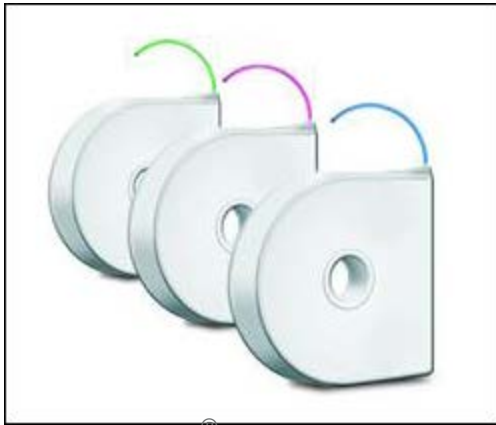
Figure 2. A Cube ® 3D plastic cartridge.

increase the adoption rate of 3D printing by selling the printer at a much reduced cost, even almost for free, and then make consistent money on the sale of the cartridge spool or printing filament. Figure 2 below shows an example of a disposable 3D printing filament package.