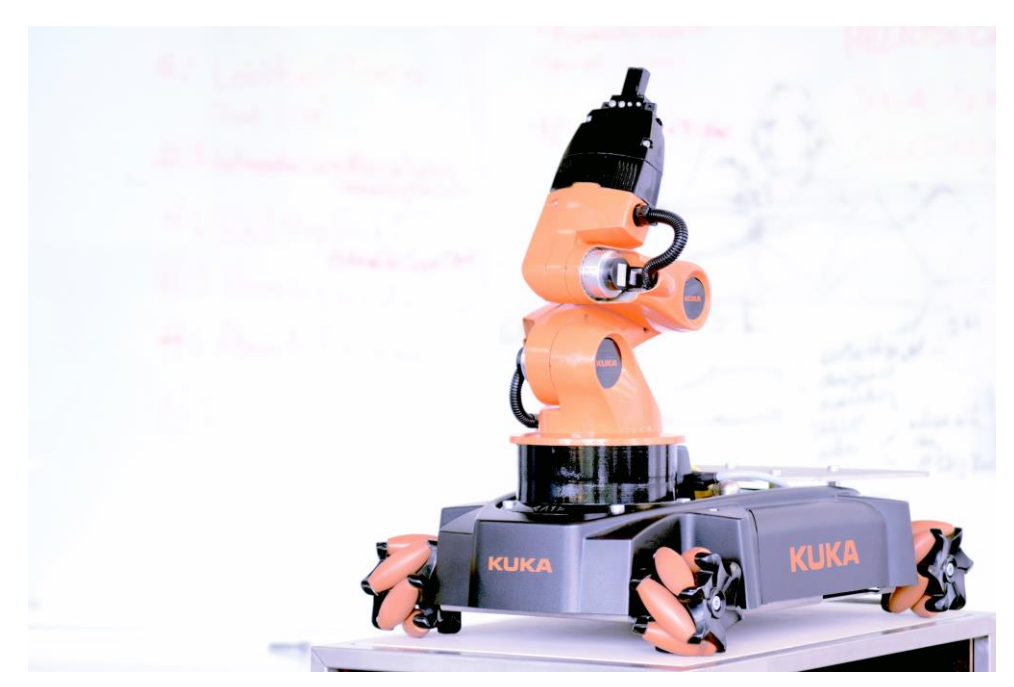
Figure 2 – All control and communication embedded in KUKA's YouBot is taken care of by Trinamic, freeing KUKA's engineering teams from motion control so that they can focus on their core expertise instead.