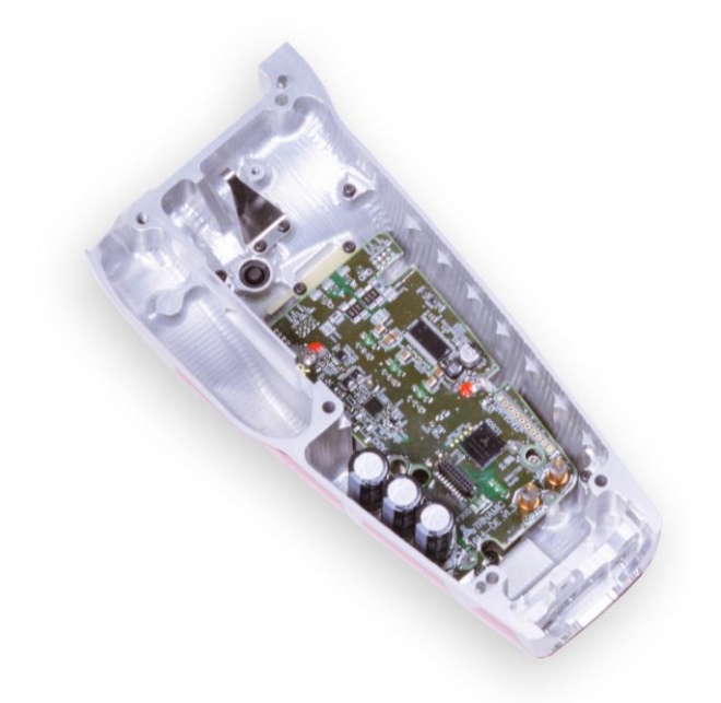
Figure 1 – Miniaturized PCB custom-made for a perfect fit in Össur's Power Knee, a battery-powered prosthetic leg.

Other applications being enabled by this trend include 3D printing, and IoT-connected devices for consumers. This latter group includes connected home devices such as window shades, blinds, and cameras for smart home systems; environmental controls such as connected thermostats; appliances; robots; drones; automotive; and consumer devices that require stepper motors. For wearables, some examples are small portable insulin pumps containing small stepper motors, which also need a wired or wireless interface and are battery driven, and virtual reality goggles.