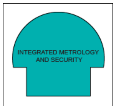
Figure 2. A single-board meter embeds secure functions on the metrology chip itself.

encryption in a separate metrology area, meter data can be encrypted immediately following measurement. This step closes any potential security gap from metrology to communication. Data received following the installation process can be trusted as valid. A utility can then compare post-installation data with meter reads from the old meter to ensure correctness. By placing encryption on the metrology chip, the ZEUS SoC closes the gap between metrology and communication ( Figure 2 ); it does not offer a window for hackers to enter the network. Beyond installation, the security envelope ensures the integrity of meter data during the entire operational life of the meter.