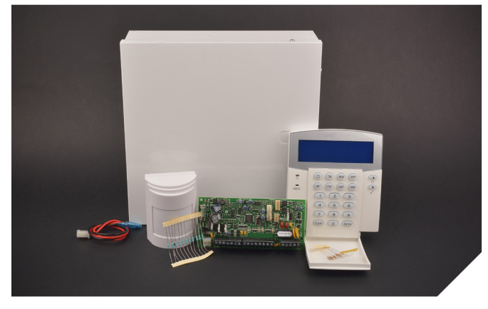
Figure 1. Traditional intrusion detection system solution deployment hardware package.

In recent years the user experience of consumer electronics, new government legislation, and the push for increased system efficiency have conspired to drive significant advances within the in-building security or intrusion detection system solutions market requirements and functional design targets. Traditional sensor types, connectivity, control interfaces, and power sourcing have all been affected to a varying degree, driving a significant shift in the look, feel, and operation of these somewhat ubiquitous applications. Historically, intrusion detection systems were mostly a simple wired set of hardware consisting of control panels, door/window contacts, and perhaps a passive motion sensor (or two) that carried minimal software integration and/or operational intricacy. Over the past decade, however, both residential and commercial building customer demands have influenced the complexity and utility of the individual components and the complete functionality of these system solutions.