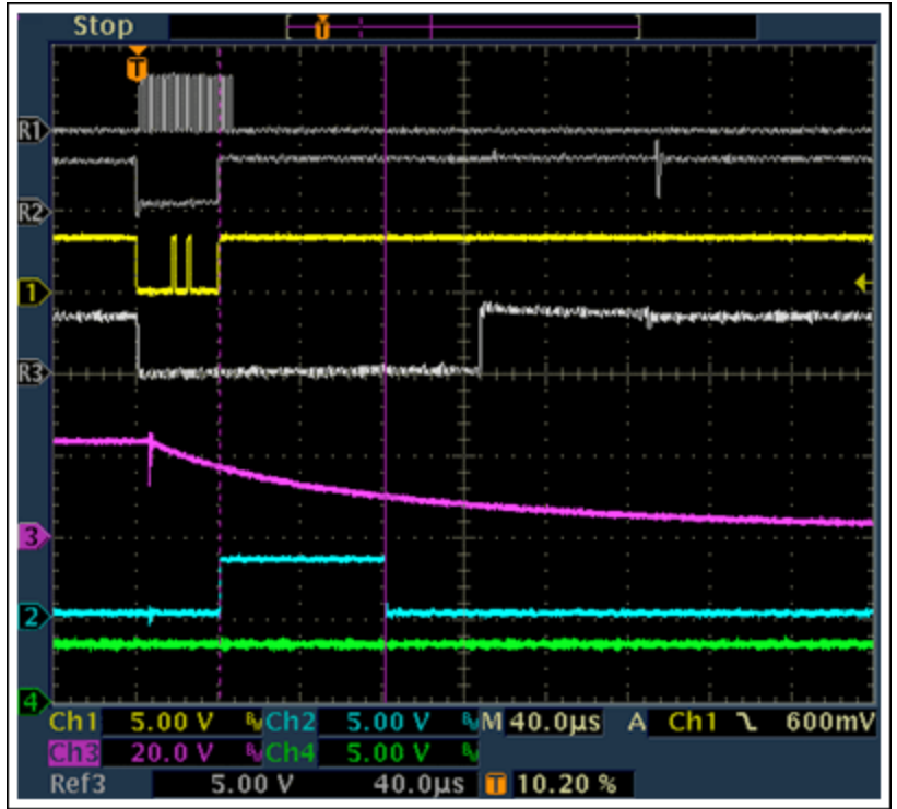
Figure 3. Unexpected wake-up pulse on active-low WU when changing from push-pull to NPN mode (R1 = SCLK, R2 = /CS\, CH1 = SDI, R3 = TXEN, CH3 = C/Q, CH2 = TXC = TXQ, CH4 = /WU\).

Figure 3 shows an example of a mode transition on C/Q while a large capacitance downstream on the C/Q line discharges. The C/QDEn bit is set to 0 during the mode-change software command and TXEN pulses low until after all expected TX_ pulses are finished. The C/Q driver is enabled again by pulling TXEN high after the voltage on the C/Q line has fallen below the 8V (min) threshold. Clearly, the device does not generate a pulse on /WU\ under these conditions.