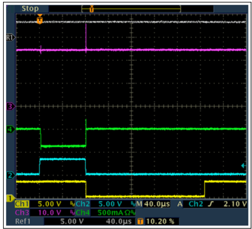
Figure 1. Valid wake-up detection in push-pull mode (R1 = TXEN, CH3 = C/Q, CH4 = current out of C/Q, CH2 = TXC = TXQ, CH1 = /WU).