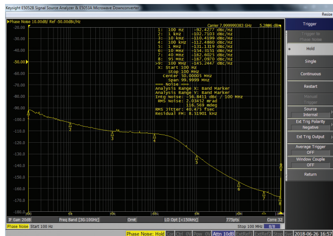
Figure 2. RMS jitter: 8.0 GHz.

While the phased-locked loop (PLL) inside of the ADF5610 boasts a modest figure of merit (FOM) of -229 dBc/Hz ( -232 dBc/Hz high current mode), when combined with exceptional 1/f noise ( -129 dBc/Hz) and state-of-the-art VCO phase noise, rms jitter numbers less than 38 fs (1 kHz to 100 MHz integration limit) are possible. This makes the ADF5610 suitable for use in the most demanding converter clock applications. Loop filter resistor values should be kept at a minimum to reduce their thermal noise and a high frequency (100 MHz). An ultralow noise reference source is essential in order to achieve this level of performance.