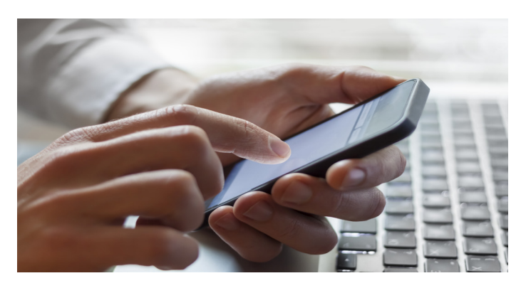
Figure 1. Smartphones Use Remote Temperature Sensors

Engineers are constantly designing temperature measurement circuits to support applications over the entire electrical equipment spectrum. A common request across industries for the electrical thermometer is to have the temperature sensing system use smaller packages and lower power. This applies to the circuits of wearable equipment, consumer mobile devices, industrial factory automation and sensors, and field instruments that require these characteristics. And so, the list goes on into numerous industries and systems. The combination of a smaller package and lower power, coupled with reliable communications, brings the silicon thermometer to a new level.