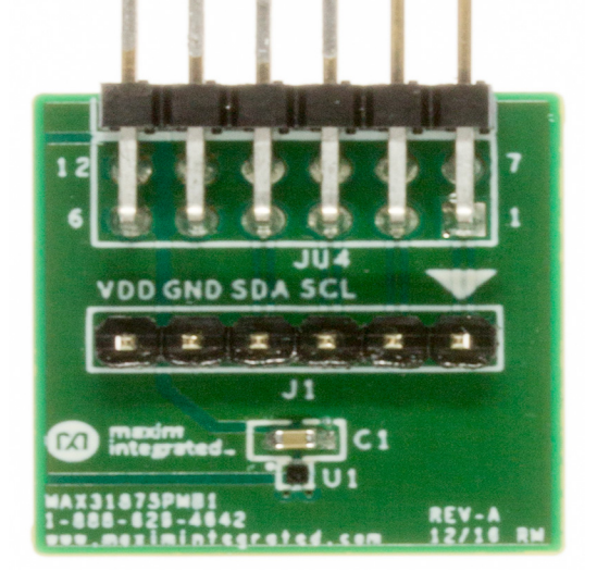
Figure 2. WLP temperature sensor (U1, MAX31875) is smaller than the SMT, 0.1mF capacitor (C1)